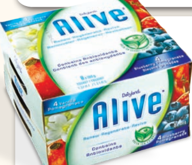
Alive has no evidence for any of its claims.

"Renew. Regenerate. Revive." Who wouldn't want that yogurt?